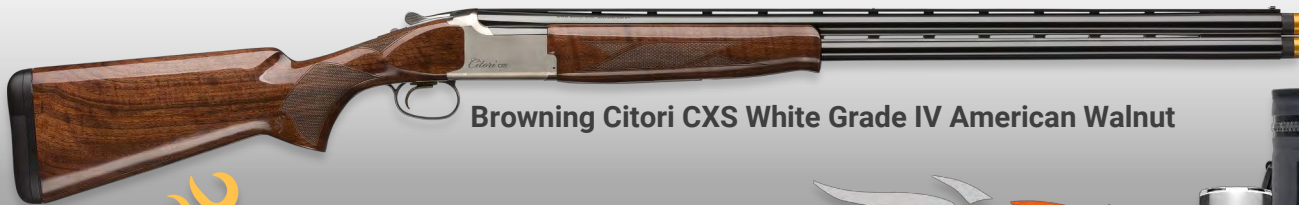
Browning Citori CXS White Grade IV American Walnut