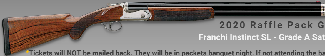
2020 Raffle Pack Gun Franchi Instinct SL - Grade A Satin Walnut O/U 12 Gauge

In addition, EACH $100 Raffle Pack contains ONE ticket for entry in the RAFFLE PACK GUN RAFFLE - the only way to enter is to get a $100 raffle pack.