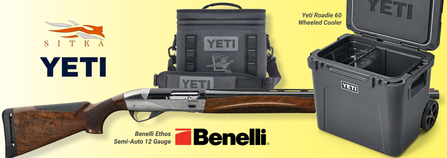
Benelli Ethos Semi-Auto 12 Gauge Benelli