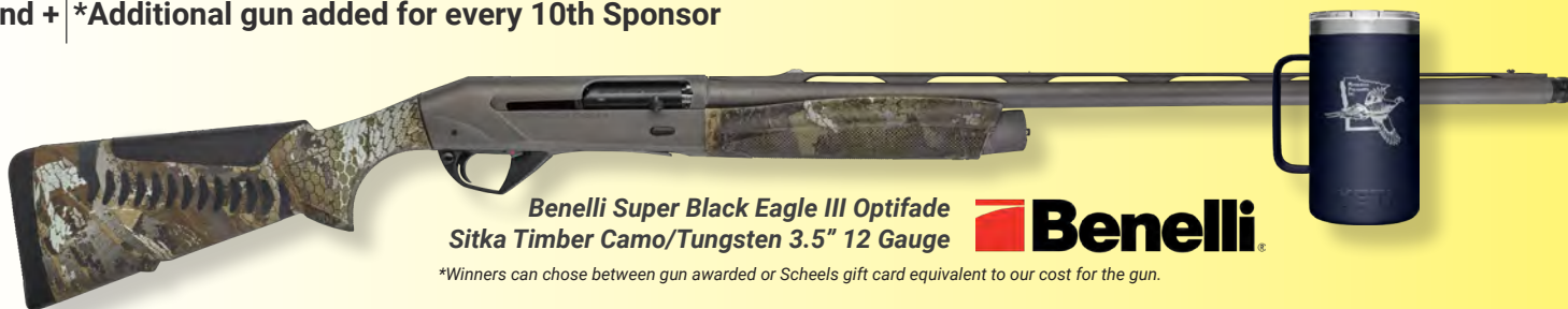
Benelli Super Black Eagle III Optifade Sitka Timber Camo/Tungsten 3.5" 12 Gauge

*Winners can chose between gun awarded or Scheels gift card equivalent to our cost for the gun.