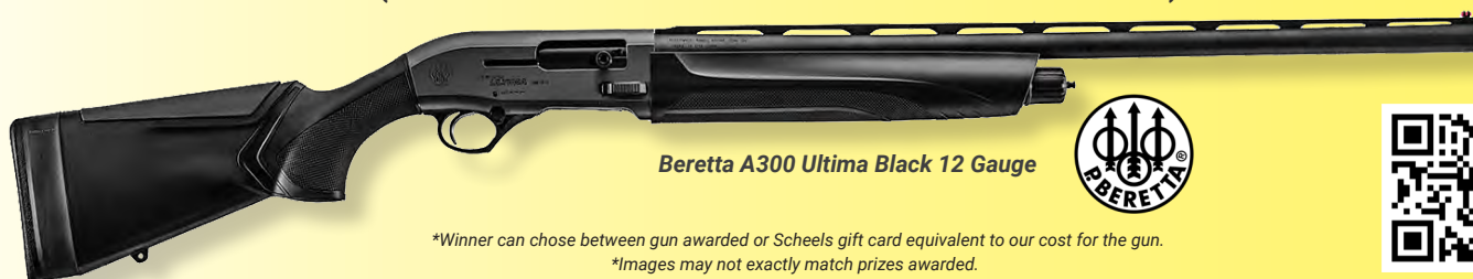
Beretta A300 Ultima Black 12 Gauge

$100 RAFFLE PACK GUN - Included in $100 Raffle Pack - Not Sold Separately (Each $100 Raffle Pack contains one Raffle Pack Gun ticket)